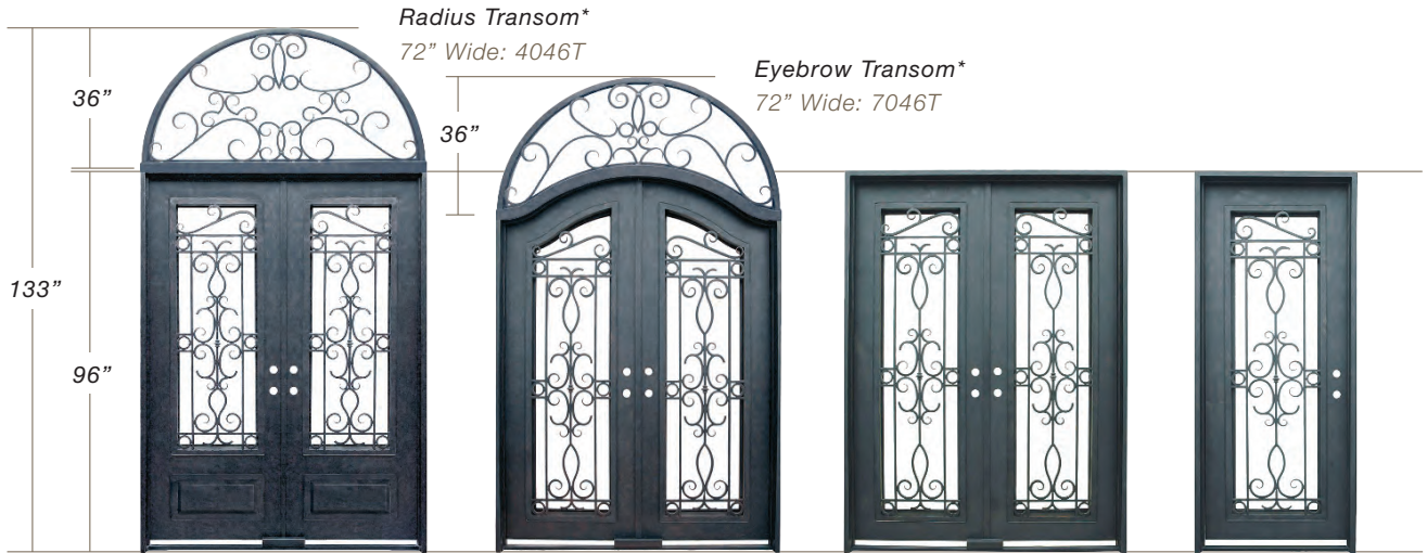
Segment 64" Wide: 8046-64 72" Wide: 8046-72