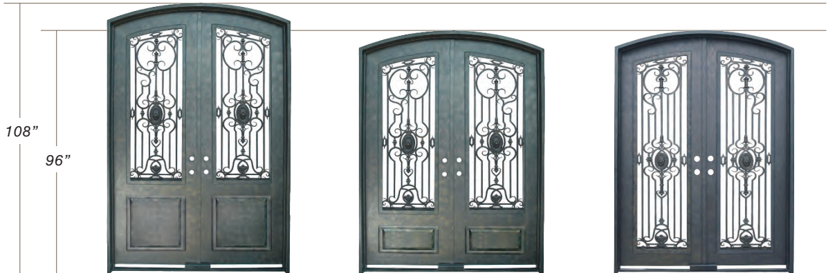
9'0 Segment 3/4 Lite 72" Wide: 8845-72108