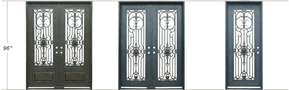
Standard 3/4 Lite 64" Wide: 4845-64 72" Wide: 4845-72