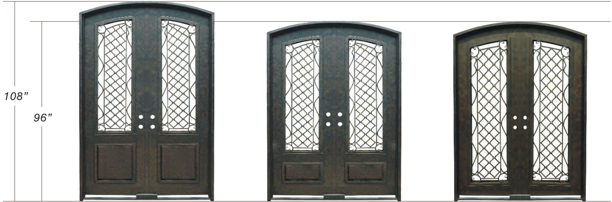
9'0 Segment 3/4 Lite 72" Wide: 8850-72108