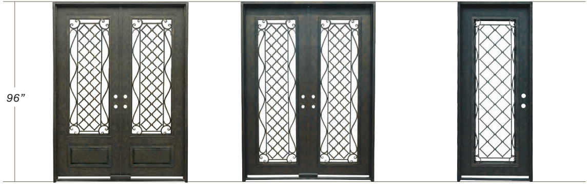
Standard 3/4 Lite 64" Wide: 4850-64 72" Wide: 4850-72