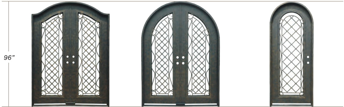
Eyebrow 64" Wide: 7050-64 72" Wide: 7050-72