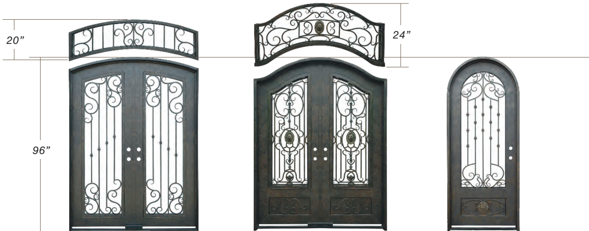
Segment (72" x 96") & Segment Transom (72" x 20") (note - unit height with transom: 112")