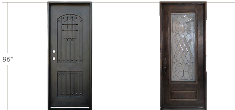
Standard with Arched V-Groove 39-1/2" x 96"