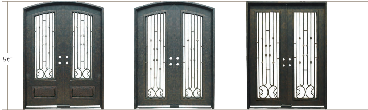
Segment 3/4 Lite